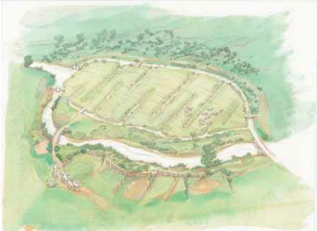
Figure 1: Reconstruction illustration of a Victorian bedwork water meadow with sheep grazing between the water channels

The Archaeology of the Gravel Terraces of the Upper and Middle Thames: The Thames Valley in the Medieval and Post-Medieval Periods AD 1000-2000